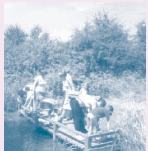
Mansbridge Primary School, Manchester

They decided on a trip to Itchen Valley Country Park.