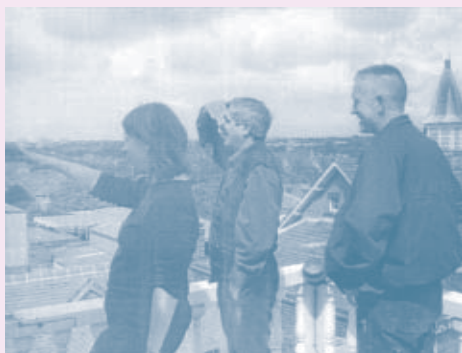
Share dads on top of Bruce Castle

and showed the fathers the cameras and samples of work. They were also very interested in seeing how many changes had taken place in the many photographs of the local area.