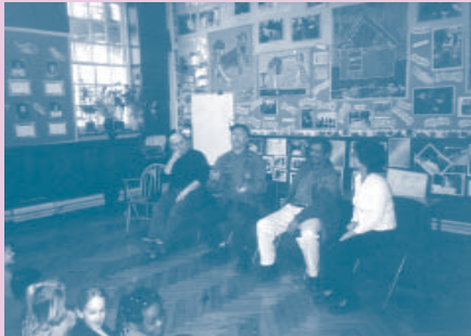
Share Dads in assembly

After Stephen Twigg (at that time Minister for Young People and Learning) launched the Dads and Sons 'Give an Hour' scheme, Haringey wanted to support and promote this national initiative. They decided to pilot a 'Dads only' Share group at South Haringey Infants School.