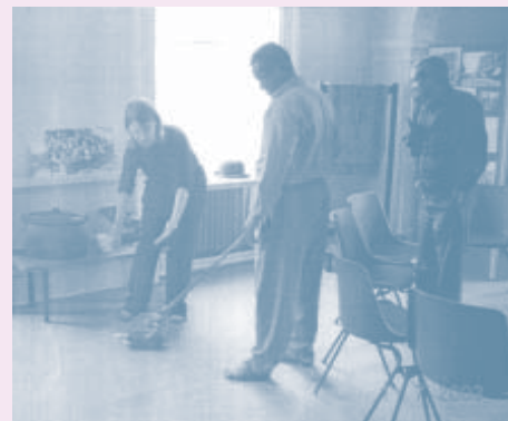
Share dads using an old carpet sweeper