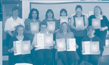
Hampshire parents with their First Aid certificates