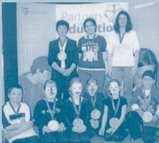
Parents and children from family learning groups in Stanhope and Laygate Primary Schools